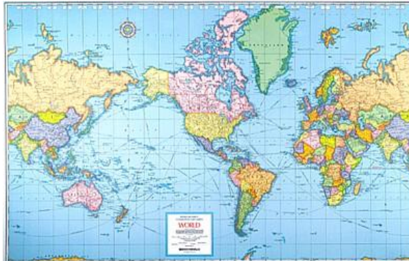
The Mercator projection

A: You know the old Mercator projection for maps of the world. The tropical regions are small and the polar regions are more and more magnified the closer to the poles you get. Greenland looks as big as Africa and Antarctica becomes literally infinite, so the map has to be topped and tailed short of the poles. The directions in the map are all correct but the scale changes ever faster as you approach the poles, which become mathematical infinities. Well, the infinite God is like a pole on a Mercator map. From a global perspective, when you see life in the round, the God of Abraham is just a father figure, an idealized or