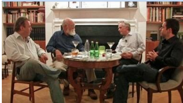
Christopher Hitchens, Dan Dennett, Richard Dawkins, Sam Harris DVD cover picture, richarddawkins.net